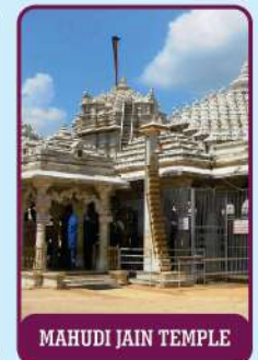
MAHUDI JAIN TEMPLE