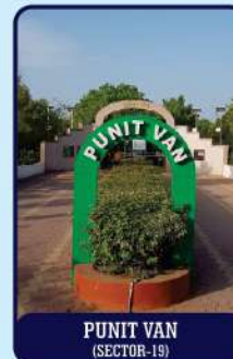
PUNIT VAN (SECTOR-19)